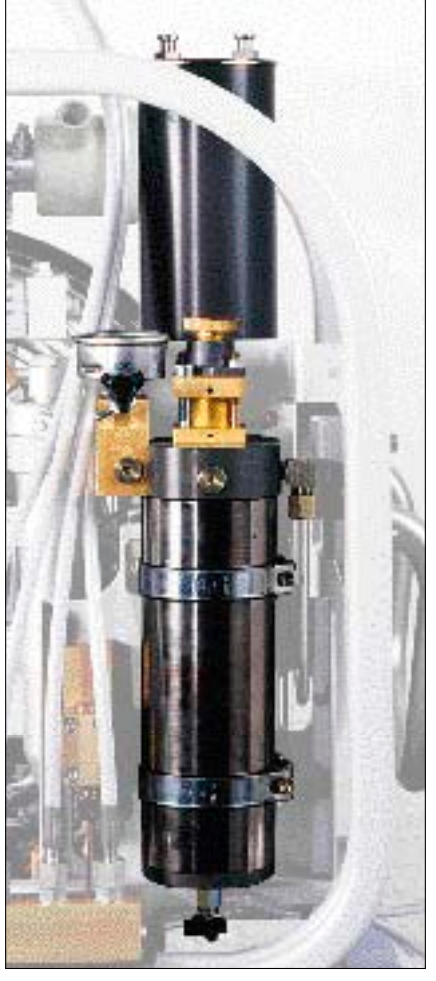
P41 filter system