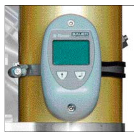
B-TIMER for filter monitoring